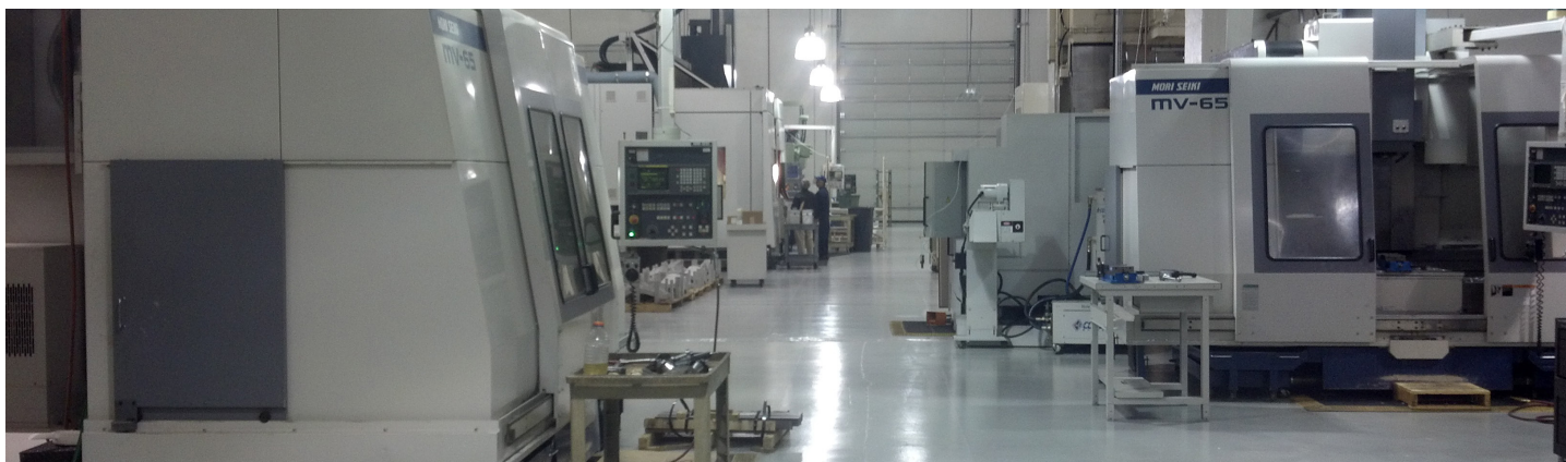
3-Axis/4-Axis Vertical Machining Cell

An eye toward innovation throughout the manufacturing engineering process maximizes your value and results in a cost-competitive, reliable and value added solution. We can also support projects with existing design and file formats using software that includes Mastercam, Catia V5 and Vericut.