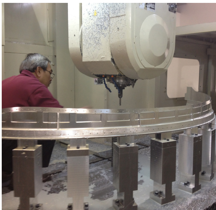
Engine Ring Segment in process for an SNK RB200F 5-Axis Bridge Mill

We offer a unique perspective that blends our performance-driven defense experience with the cost-conscious needs of commercial aerospace. The results are optimized solutions with the sense of urgency today's marketplace demands.